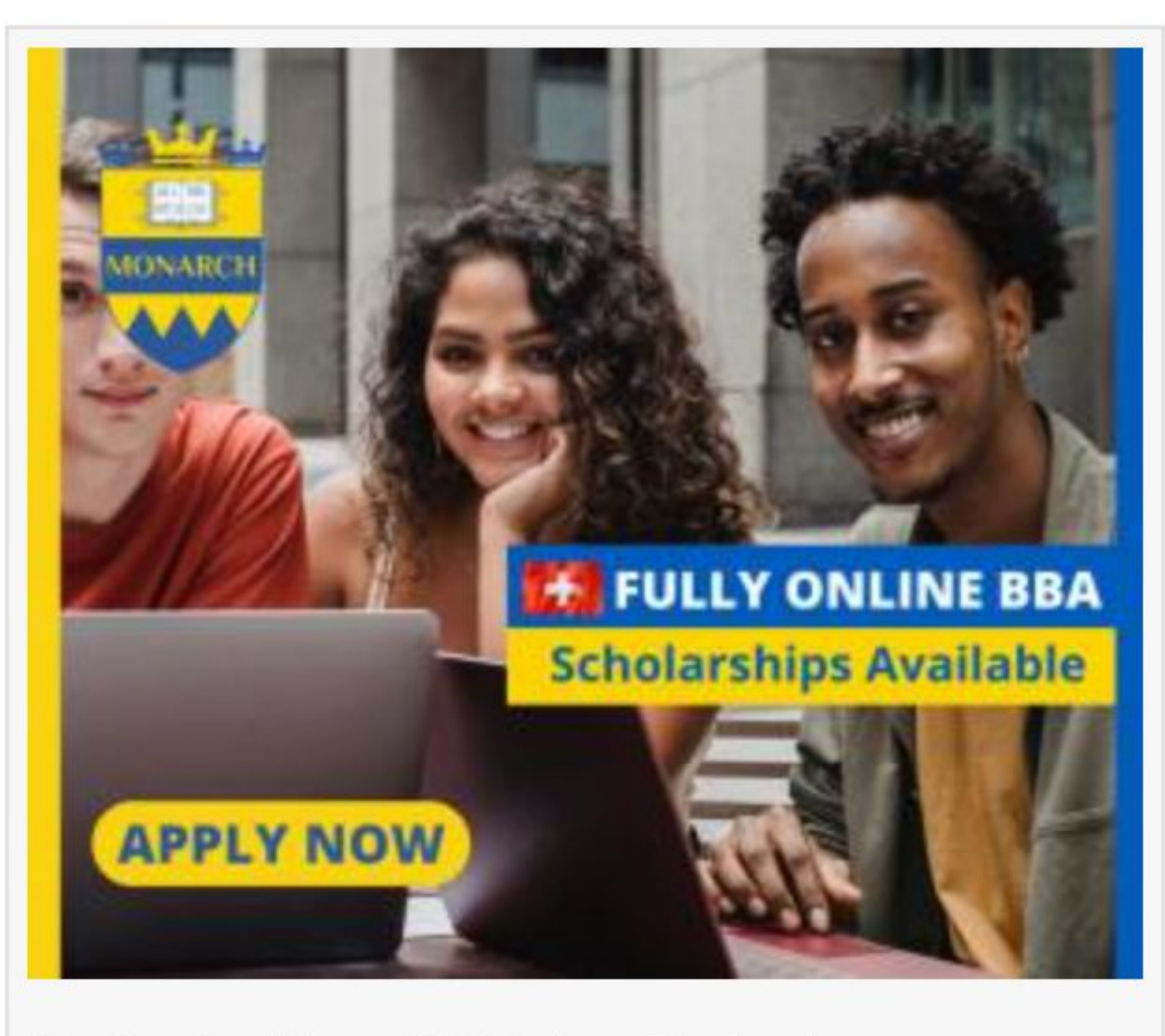
Fully Online BBA In Global Management Program Scholarships